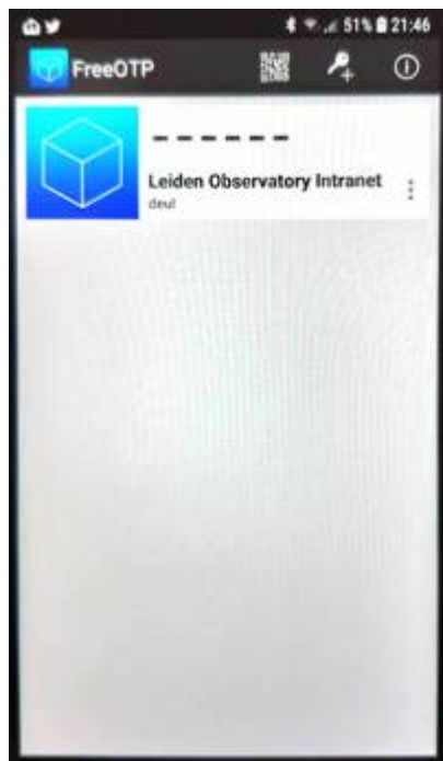
Figure 3: FreeOTP ID block after scanning QR code (Click image to enlarge).

After entering your account credentials you are presented a QR code on the next page. Now use your smart phone APP to scan this QR code. This QR code is in fact your personal secret key, which you are now saving to your smart phone.