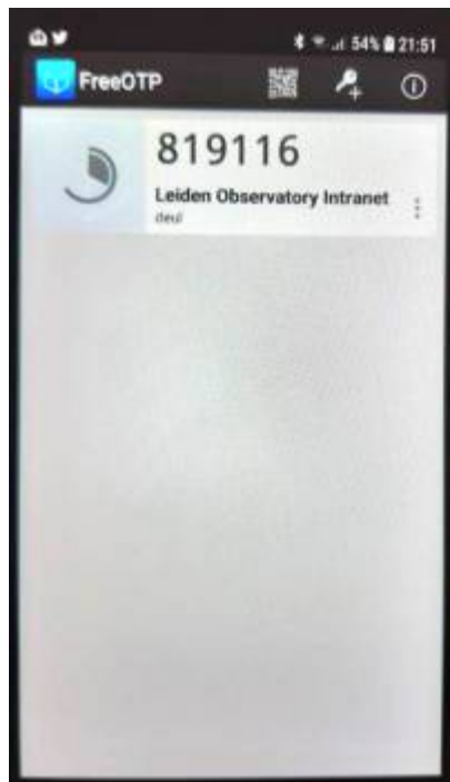
Figure 4: FreeOTP Generated passcode (Click image to enlarge).

Once you scanned the QR code you get an identity block on your smart phone screen indicating the Observatory Identity server and your username, in this case we show the FreeOTP APP: