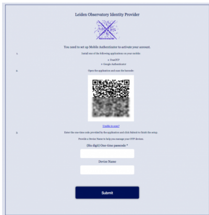
Figure 2: 2FA setup secret key form (Click image to enlarge).

After you have installed one of the two APPs you are ready to proceed. You now have to go to a web page that helps you setup 2FA. This page is located in our Self Service area . When you access that page you are redirected to the new Observatory Identity Provider and presented with a login window.